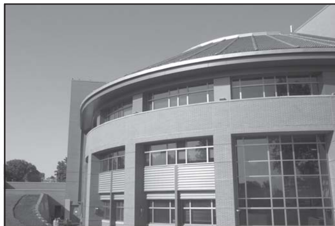
Addition to the McCollum Science Building.