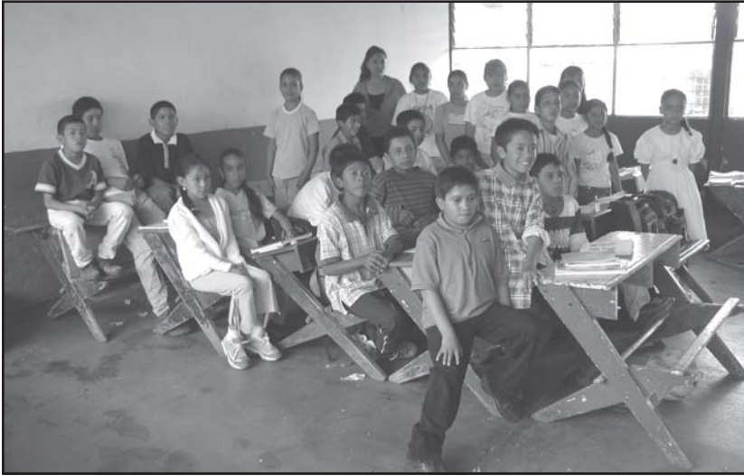
A classroom in Central Mexico

appreciation for the critical role newcomers play in ensuring the long-term social and economic vitality of Iowa's businesses, schools, and communities.