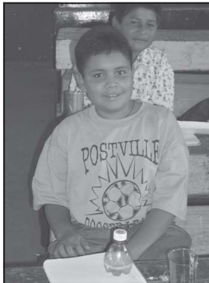
Iowa-Mexico Connections: This T-shirt from the Postville, Iowa Soccer League is worn by a pupil in Villachuato, Michoacan, Mexico

The New Iowans Program (NIP) guides and prepares Iowa communities, schools, and businesses as they accommodate immigrant and refugee newcomers living and working in Iowa. It provides tailored consultation for community leadership, conducts research relating to issues facing newcomers and communities, develops innovative training programs for business and industry, and educates Iowans concerning the needs, challenges and opportunities of their new immigrant neighbors, co-workers, and employees. All NIP programming incorporates a strong