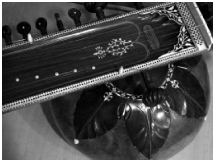
Now on display in the "A World of Music" exhibit is this sitar from Northern India.

The Museums frequently collaborate with academic departments for new exhibits and programs. Our current exhibit, entitled "Music of the World," is a good example. This ethnomusicology exhibit combines musical instruments from the University Museum's collection with those in the School of Music (originally collected by Professor Emeritus Emil Bock). This fall, a similar collaboration with the Department of Theatre will produce our new changing exhibit,