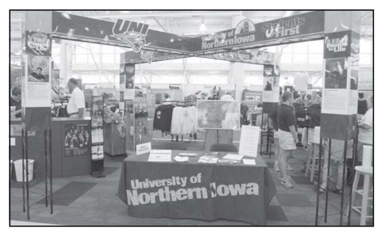
In 2003, UNI displayed information in their booth at the Iowa State Fair

UNI will help the Iowa State Fair celebrate its 150th anniversary by exhibiting our long history of service to Iowans through education. We're constructing a 1920's era oneroom school as part of our exhibit in the Varied Industries Building. The booth will